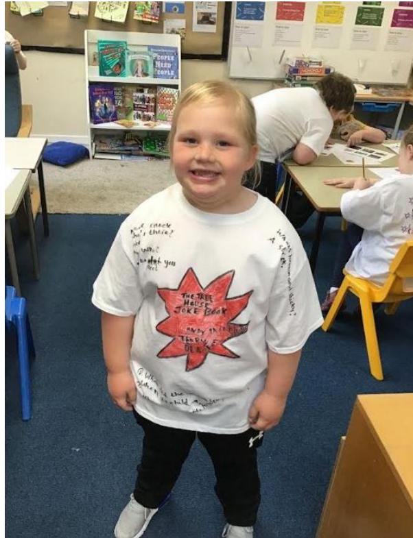
3 - Our Ferns class thoroughly enjoyed World Book Day.

Creating our own T-shirts, quizzes and games...what's not to love?