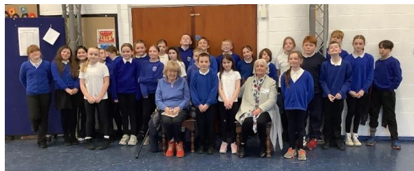
7 - Our Kingfishers enjoyed listening to two of our Riverside family who were evacuated during WW2- they interviewed them and they shared their experiences.