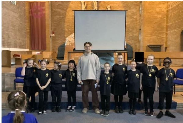
5 - Our Larks enjoyed learning The Tummy Beast and were awarded best prize at the North West Oracy Hub Competition. They did really well at learning all of the words and performing with expression.