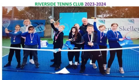
11 - Our tennis champions had a fabulous day at Thorndale.