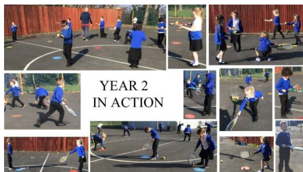
10 - Our Bluebells had a blast learning new skills.