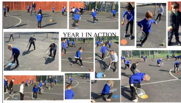
9 - Our Conkers Class enjoyed their tennis session.

Riverside Tennis Club took part in the Wallasey Tennis Tournament at Thorndale Tennis Club. Their first ever tennis tournament and they were runners-up! They did us proud. Congratulations to them all. A great afternoon was had by all.