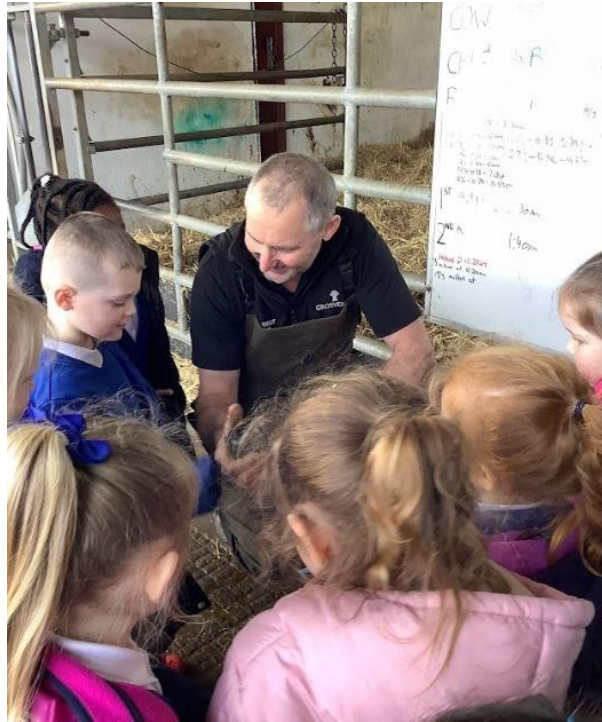
6 - Acorns had a wonderful time on their trip to Lea Manor farm to learn all about the importance of worms to cows!