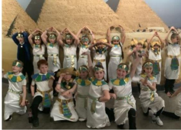
8 - Our Adder class performed an Egyptian flash mob at the Liverpool museum!