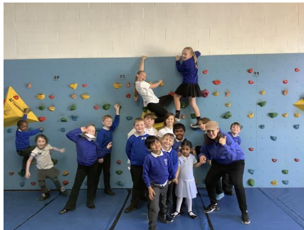
12 - A huge well done to this week's 5-Star learners :)