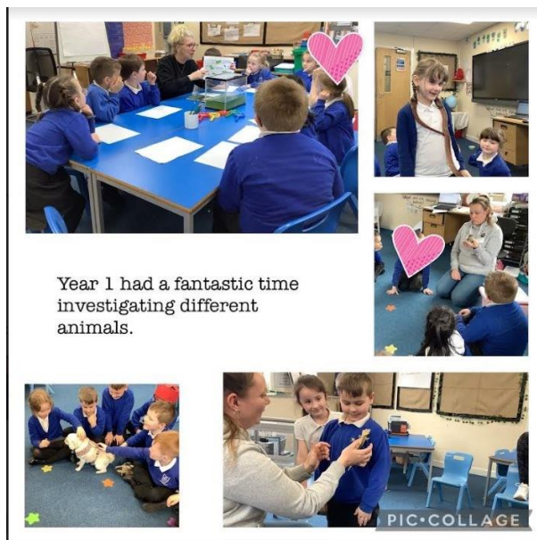
Year 1 had a fantastic time investigating different animals.