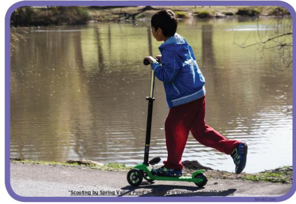
"Scooting by Spring Valley Pond" by Paul is licensed under CC BY 2.0