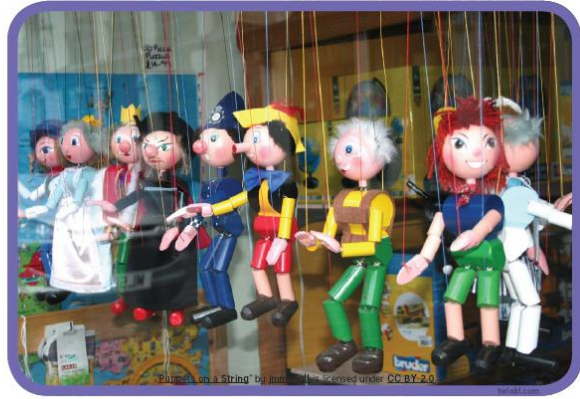
"Puppets on a String"