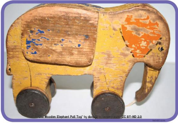
"Old Wooden Elephant Pull Toy"